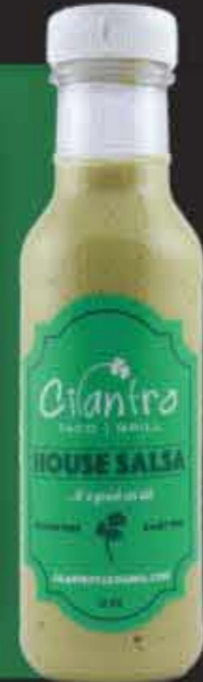
CILANTRO HOUSE SALSA $4.50 per bottle