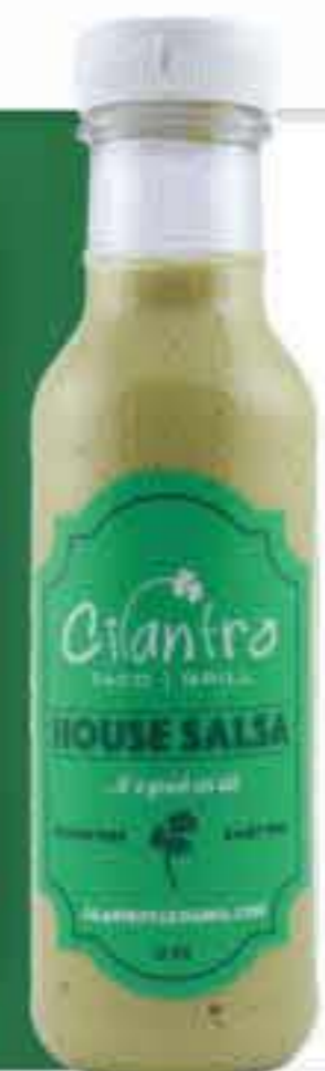
CILANTRO HOUSE SALSA $4.50 per bottle