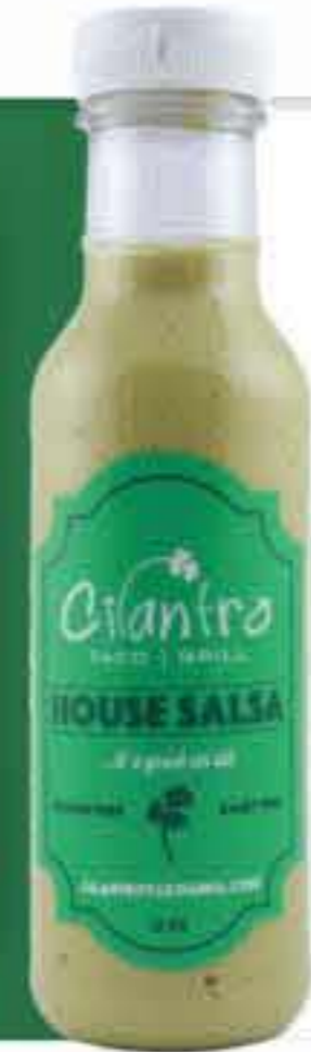
CILANTRO HOUSE SALSA $4.50 per bottle